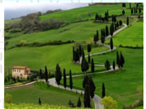
OOTY TEA GARDEN